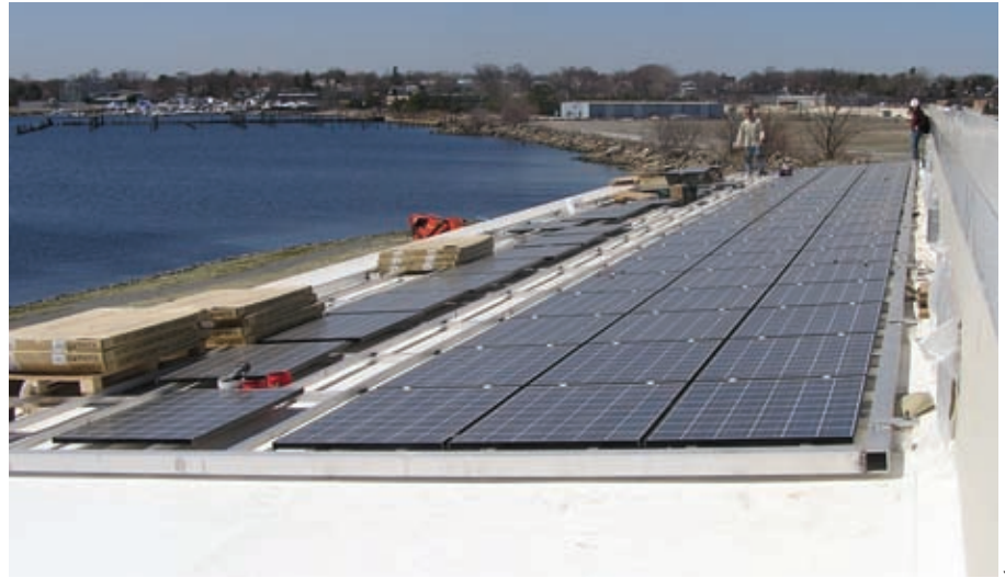
The Save the Bay headquarters in Providence won an EPA prize for brownfield development and includes solar panels and a “green” roof.

Buildings. Rhode Island's relatively old stock of residential, commercial, and