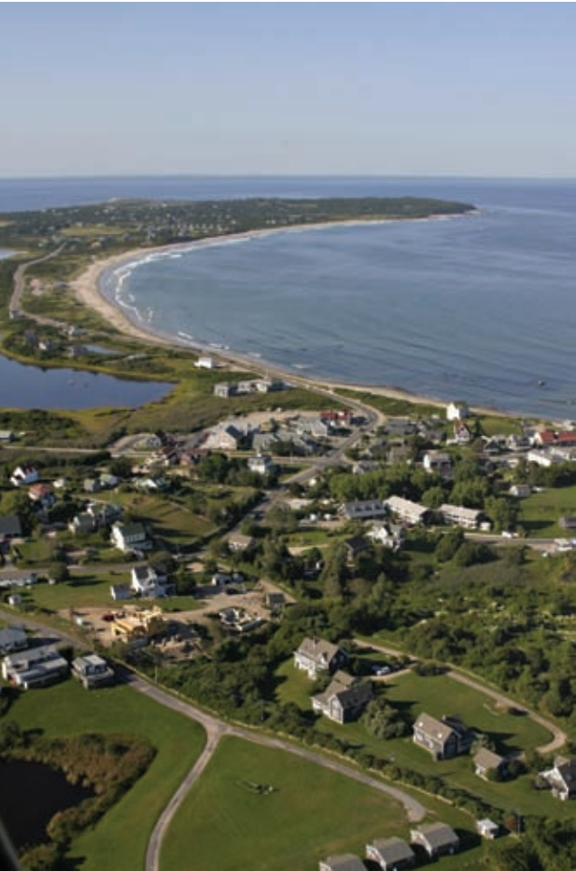
Beaches, such as these on Block Island, will become increasingly vulnerable to erosion as sea level rises, and neighboring homes will become more vulnerable to coastal flooding.

coastal flood in Woods Hole, MA (one of five sites analyzed in this study) is expected to occur as frequently as once every 21 years, on average, by late-century if the lower-emissions scenario prevails and once every nine years, on average, under the higher-emissions scenario. Rhode Island has a lengthy history of protecting itself against the sea, but the extra stresses created by sea-level rise and more frequent and extensive flooding can be expected to severely tax both new and aging infrastructure and threaten vulnerable coastal communities across the state.